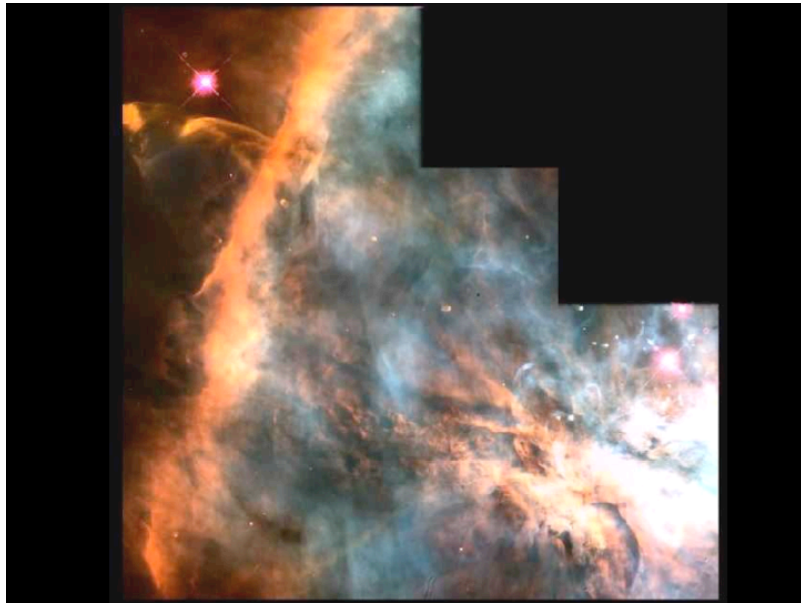
Fig. 1: Hubble image of the Orion Nebula. In addition to the massive stars of the trapezium near the centre, this stellar cavern contains 700 other young stars at various levels of formation. Their occurrence here lends support to the idea that planetary systems are common. High-speed jets of hot gas spewed by some of the stars appear as thin curved loops sometimes with bright knots on their ends (lower left).